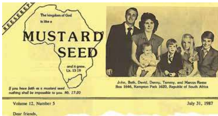
An issue of the Reese family “relationship” newsletter from 1987

F or many congregations, it is budget-preparation season—time to reconsider your missions effectiveness. Does your overall budget reflect Jesus' priority as stated in the Great Commission? Are your members sharing the saving Message? Are you partnering for maximum impact?