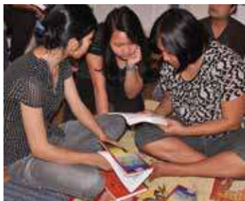
Refugees from Burma with Bible and WBS courses

have a better life. You may go as fast as a rabbit or as slow as a turtle to achieve your dream, just so long as you keep going.