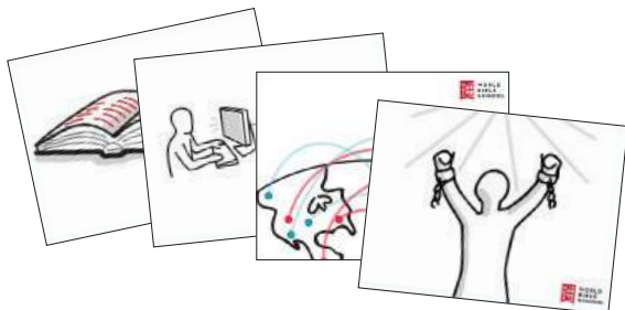
POWERPOINT (with script)